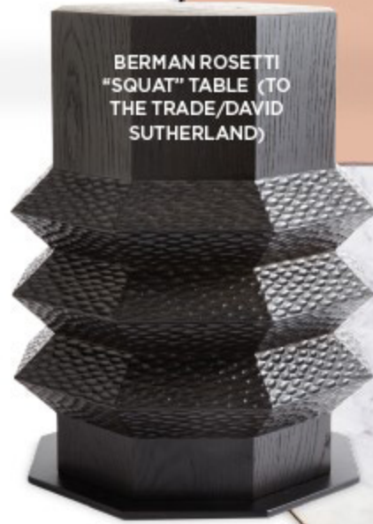
BERMAN ROSETTI "SQUAT" TABLE (TO THE TRADE/DAVID SUTHERLAND)