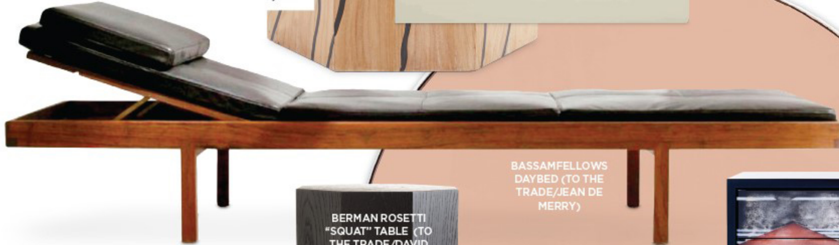
BASSAMFELLOWS DAYBED (TO THE TRADE/JEAN DE MERRY)