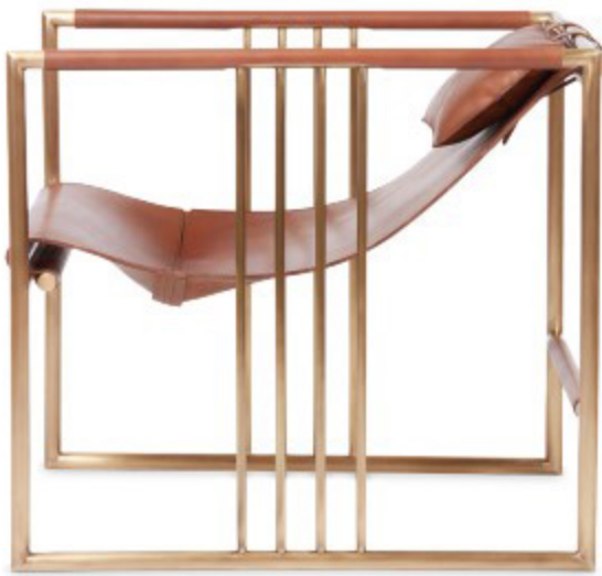
MCGUIRE "HAYBINE" SLING LOUNGE (PRICE UPON REQUEST/ BAKER)

Let Marfa's West Texas landscape and MODERN DESIGN be your muse.