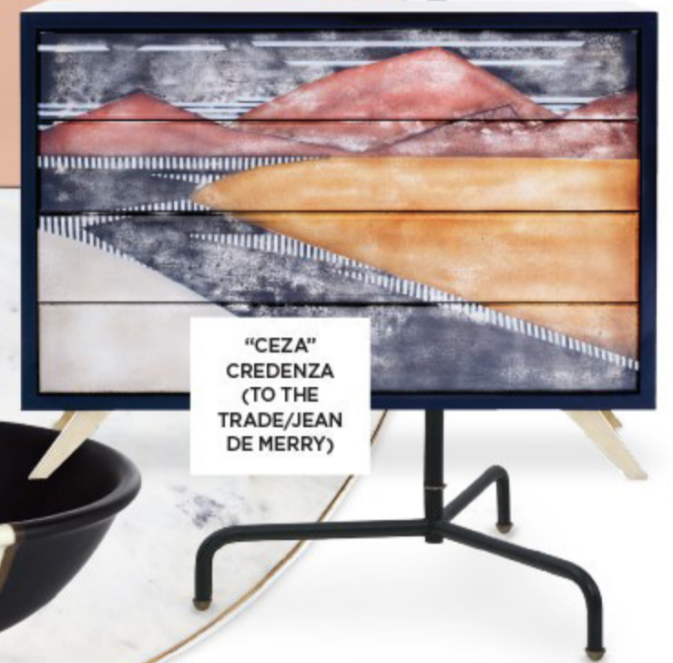
"CEZA" CREDENZA (TO THE TRADE/JEAN DE MERRY)