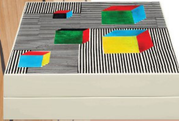
"MILLE JEUX" LARGE BOX ($1,425/HERMÉS)