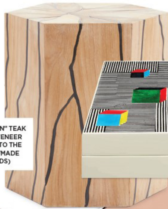
"BRONSON" TEAK WOOD VENEER STOOL (TO THE TRADE/MADE GOODS)