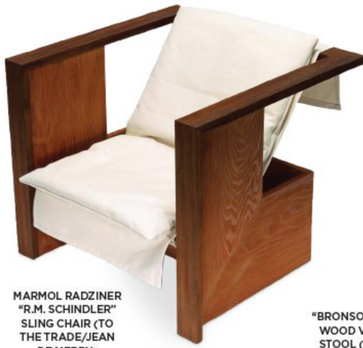
MARMOL RADZINER "R.M. SCHINDLER" SLING CHAIR (TO THE TRADE/JEAN DE MERRY)