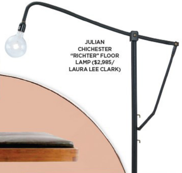
JULIAN CHICHESTER "RICHTER" FLOOR LAMP ($2,985/ LAURA LEE CLARK)